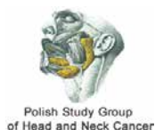
Polish Study Group of Head and Neck Cancer